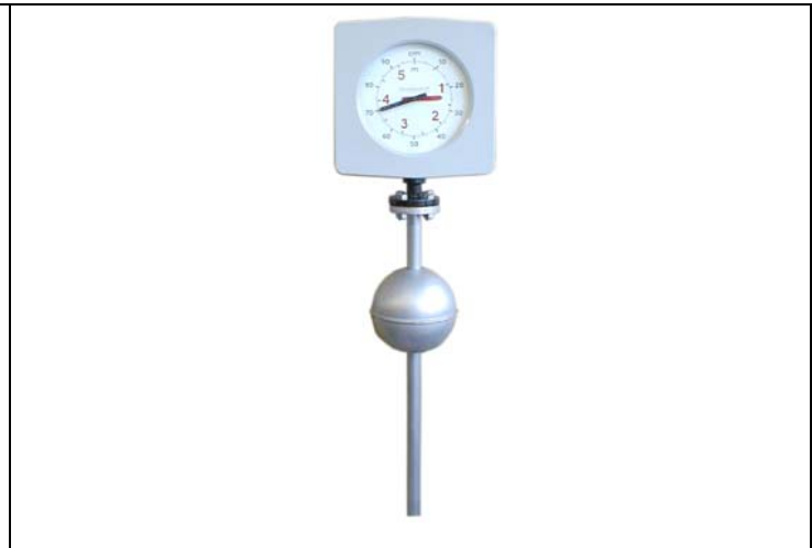
MAGLINK Level Indicator