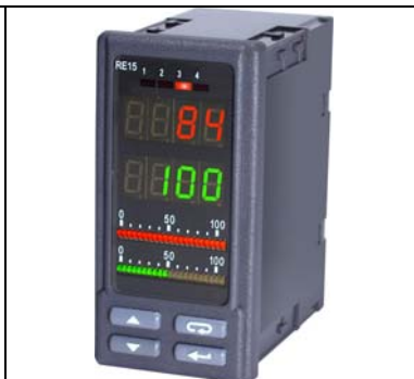
IntraCon Digital Controllers