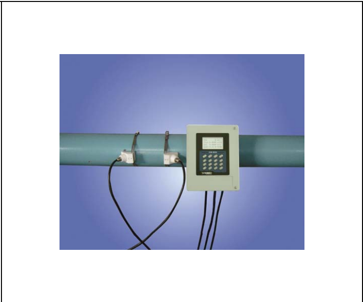
IntraSonic IS210 Ultrasonic Flow Meter