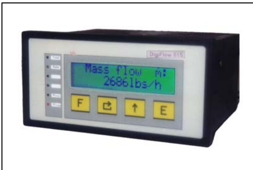
DigiFlow Flow and Level Computers