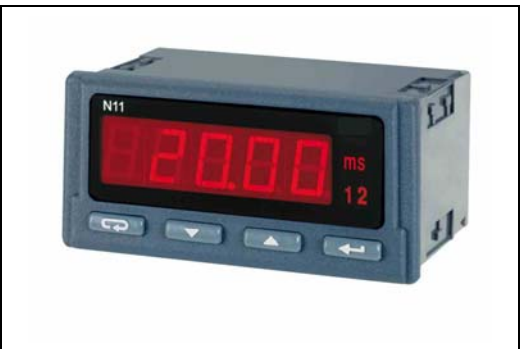
IntraDigit Digital Indicators / Meters