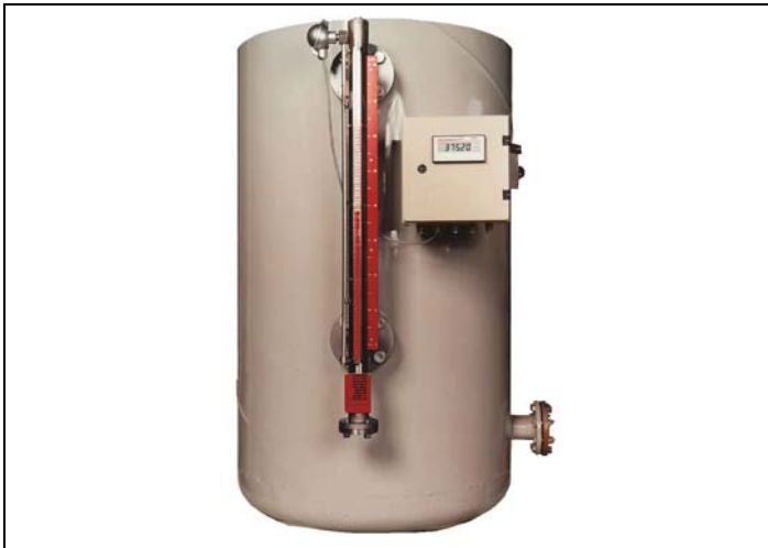
ITA-mag. Level Gauge